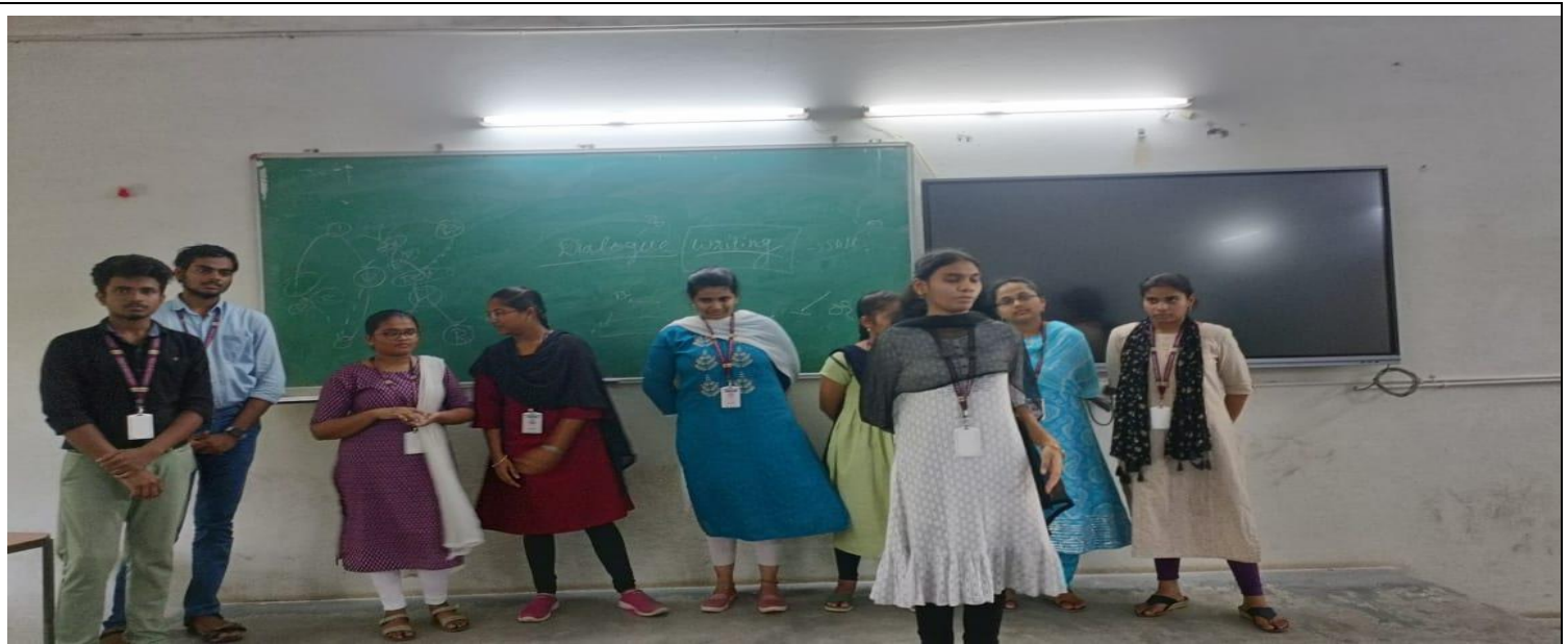
Students Participation in the Debate