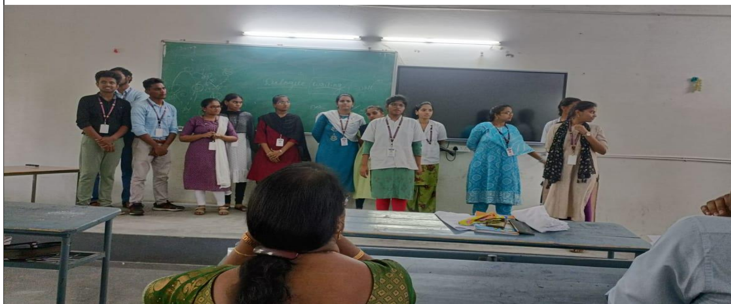
Students Participation in the Debate